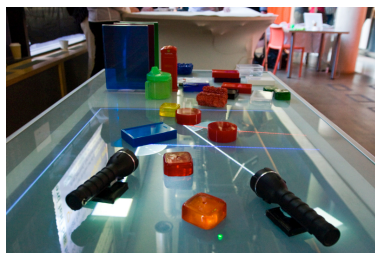
Figure 1: Interaction objects used with the tabletop

Object recognition is enabled in the system through Reactivision technology. For the studies an application was designed to support students learning about the behaviour of light and derived concepts of colour. Interaction is enabled using custom-made coloured blocks, a variety of off-the-shelf objects, and torches (Figure 1). The torches act as a light sources (causing a digital white light beam to be displayed when placed on the surface), and all other objects reflect, refract and / or absorb the digital light beams, according to their physical properties (shape, material and colour). Objects are detected by the system when placed on the surface, and correspondent digital effects are projected on the tabletop (when in co-located mode, as in Figure 2) or on a separate surface, e.g. a wall (when in the discrete mode, as in Figure 3). Multiple objects can be recognized simultaneously, thus enabling several participants to interact with the tabletop together.