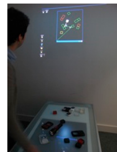
Figure 3: The discrete mode